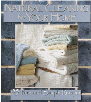
There are many books on natural cleaning products.