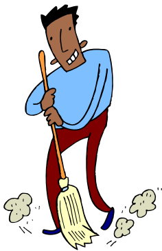
Your ears will smile and stick straight out in amazement when you clean your house!