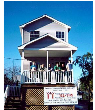
Habitat is a major helping hand in the development of houses for those less fortunate.

Or, you can e-mail habitat@msu.edu and include your name, e-mail address and state that you're interested in the 2002 Jimmy Carter Work Project.